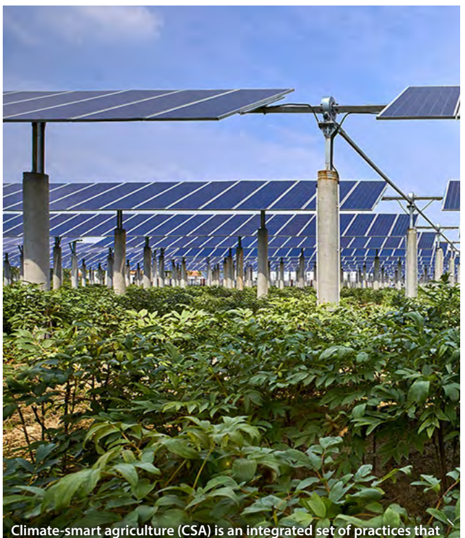
Climate-smart agriculture (CSA) is an integrated set of practices that enable farmers to increase their productivity while adapting to, or even mitigating against, climate change.