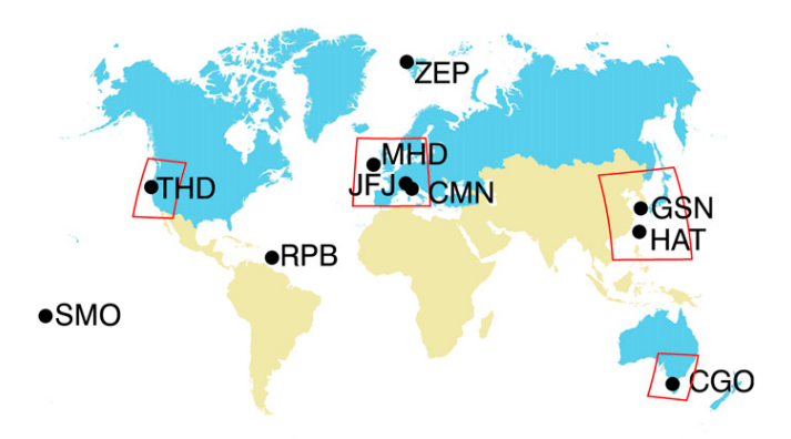
Fig. 1. Location of AGAGE and NIES stations, showing, from north to south: ZEP, Ny Ålesund, Norway; MHD, Mace Head, Ireland; JFJ, Jungfraujoch, Switzerland; CMN, Mt. Cimone, Italy; THD, Trinidad Head, United States; GSN, Gosan, South Korea; HAT, Hateruma, Japan; RPB, Ragged Point, Barbados; SMO, Cape Matatula, American Samoa; and CGO, Cape Grim, Australia. Red boxes indicate local regions where the NAME model was used with increased resolution compared with the global MOZART model, which was run for the remainder of the globe. Annex I countries are shaded blue, and non-Annex I are in pale yellow.

Following ref. 23, the high-resolution, regional Numerical Atmospheric dispersion Modeling Environment (NAME) (24, 25) was used to simulate atmospheric HFC transport close to the monitoring sites. Simultaneously, the influence of changes to the global emissions field on all measurement stations was simulated using the global Model for OZone and Related Tracers (MOZART) (26) (SI Text ). While the measurement network is relatively sparse in several regions of the world, the inversion system was designed to appropriately weight the emissions information that can be derived from global networks such as AGAGE and NIES. The high-resolution model was run within four regions, shown by red boxes in Fig. 1, outlining areas where the measurement stations were strongly influenced by regional HFC sources. These four areas were further divided into 155 subregions in total, from which emissions